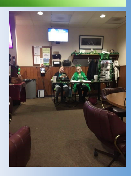
Our Posts First and Second Ladies were busy taking food orders.