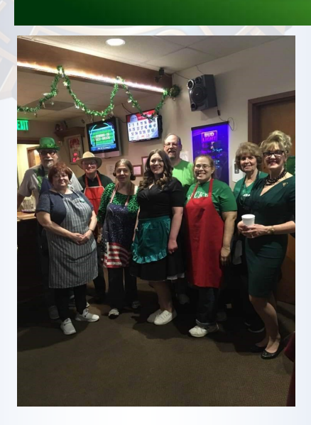
Thank you to our hard working volunteer kitchen staff. They made our day special!

A special thank you to our dedicated Friday Kitchen Volunteers. Please make sure you thank them and tell them how much you appreciate all that they do for our post.