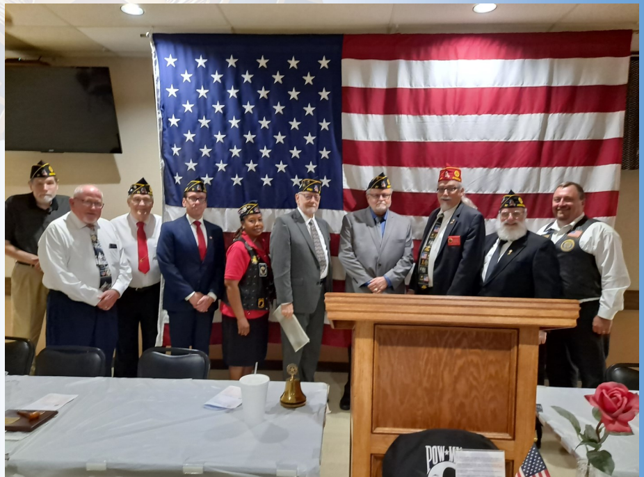
See more installation pictures on page 2.