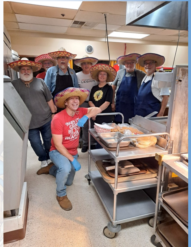
Did you know that your Post 21 Officers host Taco Tuesday's on the 3rd and 5th Tuesday of the month? Thank you Post Leaders for all that you do!