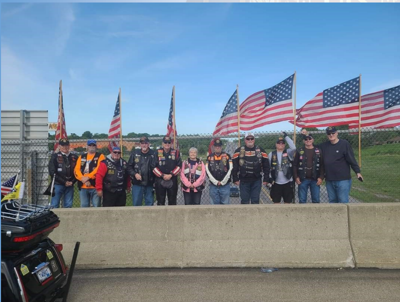
Above: Post 21 Family members placed flags on the bridge over I-70 on Lee's Summit Road to Welcome the Run For The Wall Riders as they came through.