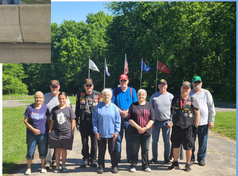
Right: Family Members of Post 21 placed American Flags on the graves of all service members at Mound Grove Cemetery for Memorial Day Weekend. They retrieved the flags on Tuesday after Memorial Day in a driving rain storm. Thank you for your dedication to our fallen Veterans!